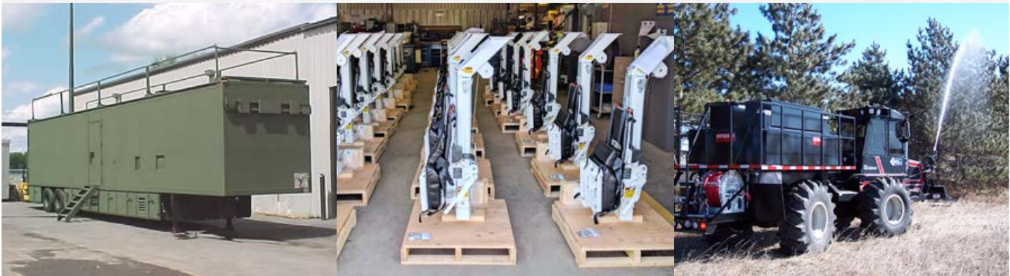
Mobile Command Centre

Since 1988, we have met or exceeded Department of National Defence In Service Support operational requirements.